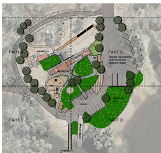
Initial Concept Design – subject to revision pending feedback

The initial concept plans have been released for public consultation. The response to date has been very positive with practical and productive suggestions received. Feedback is currently being collated and will be provided to Council's designers to review and incorporate into a revised design.