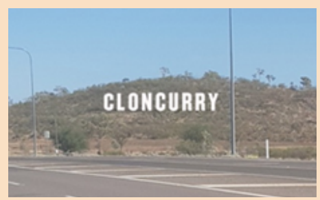
Hollywood Style Concept Drawing

The eastern and western entrances to Cloncurry will be upgraded with new signage. A "Hollywood" style signage option has been selected for the eastern entry. Council has gone to the open market for design and construction of this sign and this Tender will close in December 2021 (information on this Tender can be found on Council's website).