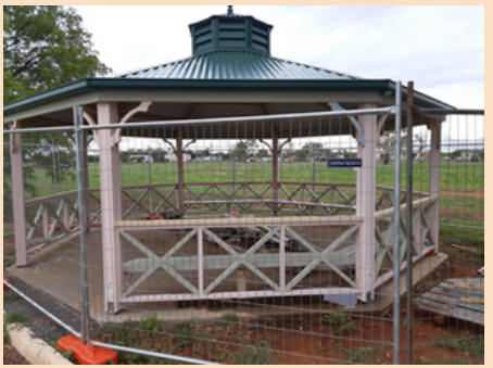
A new Gazebo under construction.