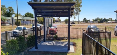
New shelter and fencing

Council has recently undertaken a range of improvements to its Curry Kids Early Learning Centre. These works have included the installation of new outdoor play equipment, shade shelters, new fencing to allow better use of the outdoor areas, external and internal painting and other minor rectification works.