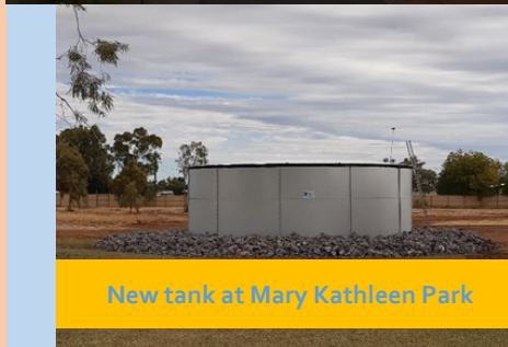
New tank at Mary Kathleen Park

Council has completed irrigation upgrades at both Mary Kathleen Park and the Recreation Grounds. Both these areas have upgraded irrigation systems and have been switched from town supply to bore. The systems are working well and showing significant savings (estimated at up to 25,000kL per year) to the town potable water supply. Preliminary designs are already being worked on to upgrade the current irrigation at the Equestrian Centre.