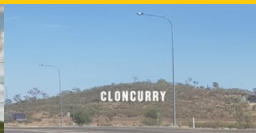
Hollywood-style concept drawing