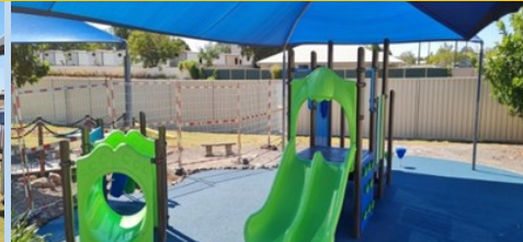
New play equipment