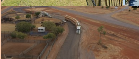
Clean Yards access road

On completion of the access road upgrade (upgrade from gravel surface to a heavy-duty asphalt pavement), new cattle unloading walkways have been installed above the existing concrete ramp. The completed works have delivered a safer working environment, during times of wet weather, for livestock operators loading and unloading at this facility.