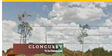
Concept drawing western approach