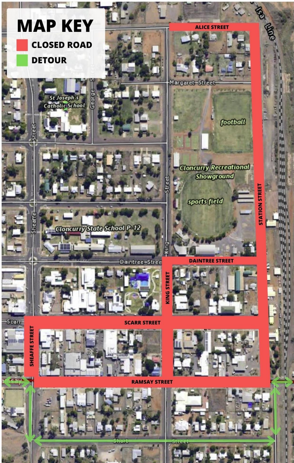
Figure 1: Local traffic detour (green).